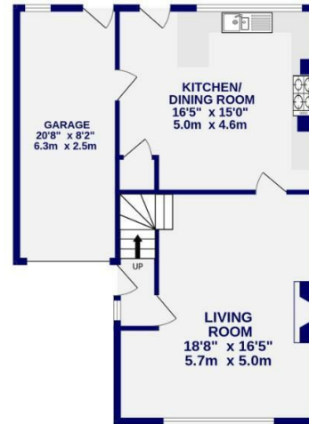
GROUND FLOOR 711 sq.ft. (66.0 sq.m.) approx.