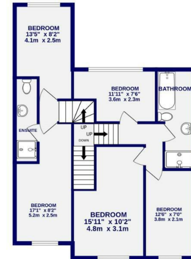
1ST FLOOR 734 sq.ft. (68.2 sq.m.) approx.